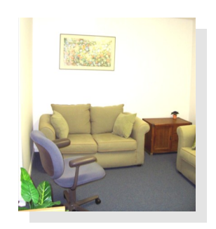
ACCESS counseling session room